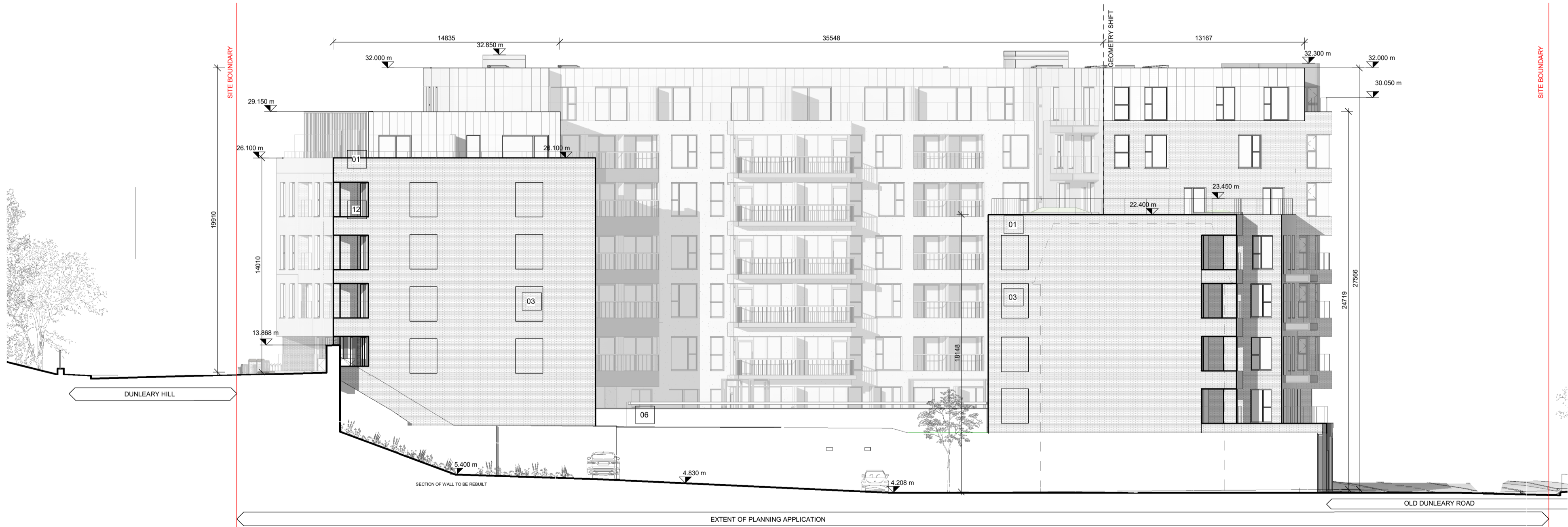
401. 9 Proposed East Elevations (C1) 1 : 200