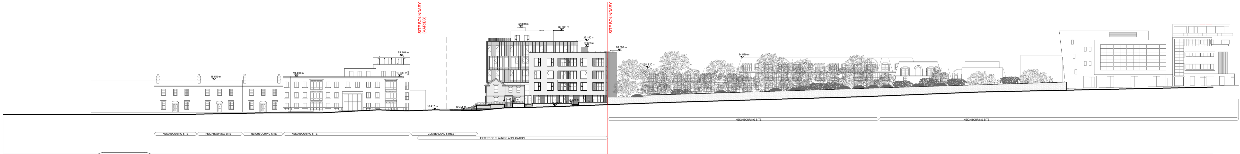
401. 1 South Elevation_Planning_Contiguous 1 : 500